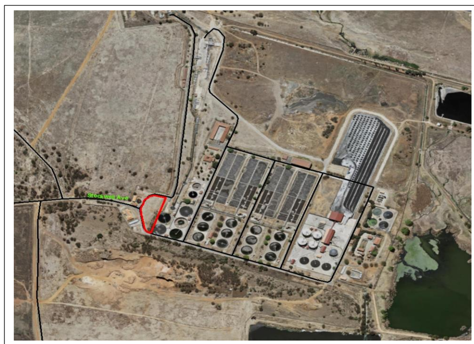
Figure 1: Location of the Bushkoppie WwTW

The proposed development will trigger the requirement of a Basic Assessment process to be undertaken in terms of Listing Notice 1 (GN. R983) and Listing Notice 3 (GN. R985), as amended, of the EIA Regulations 2014, as amended. A Water Use License (WULA) in terms of section Section 21 of the National Water Act (NWA) (36 of 1998), as amended will also be required.