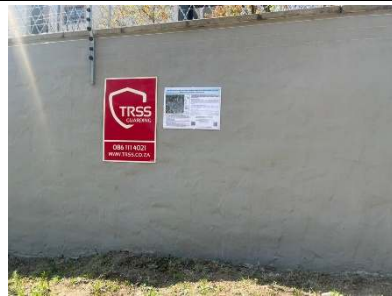
5. Site notice placed on wall of residential estate in Carlswald