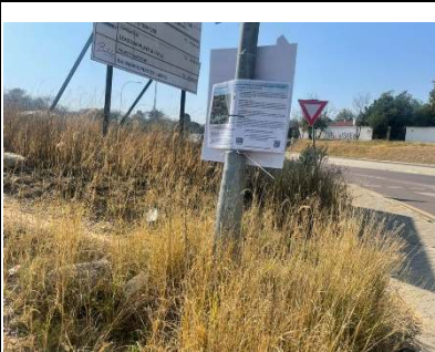
7. Site notice placed at the intersection of R55 and Ethel Avenue