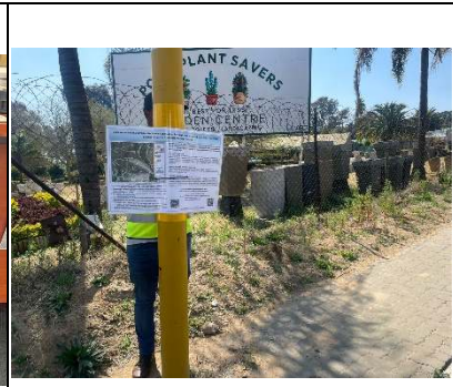
3. Pot & Plant Savers Garden Centre, 129 Whisken Avenue