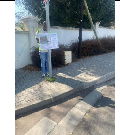
8. Site notice placed outside Whisken Apartments