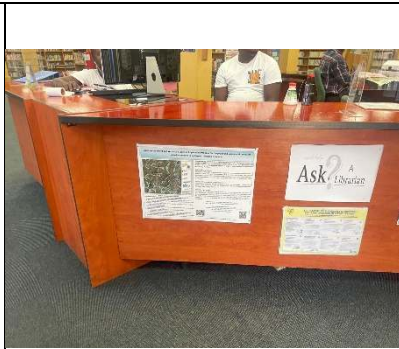
2. Site notice placed at Halfway House Library