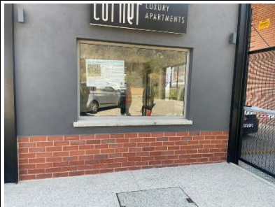
4. Site notice at entrance to Crowthorne Corner Luxury Apartments