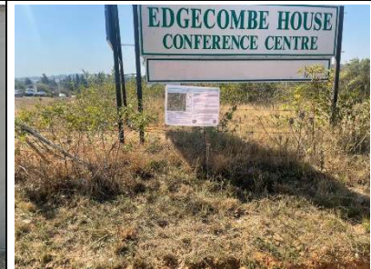
6. Site notice placed outside Edgecombe Conference Centre